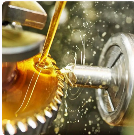
Lubricants and Pneumatics