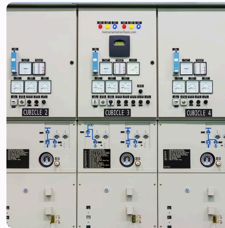
Electricals & Switchgears