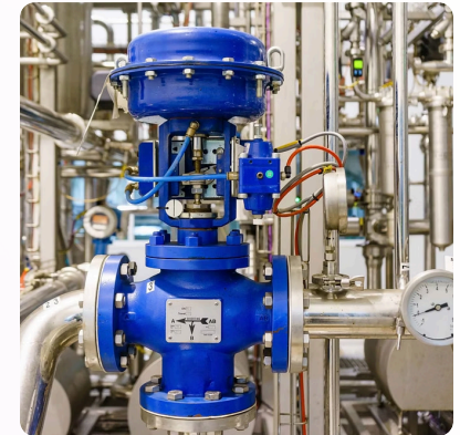
Valves and Automations