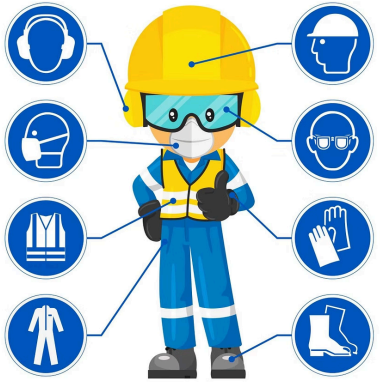
Safety Equipment & PPE Supplies