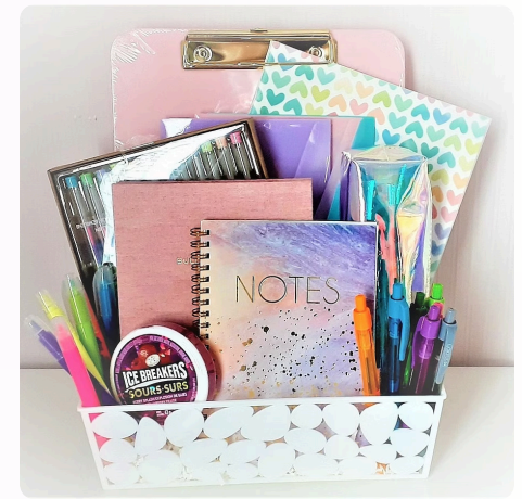
Stationary & Corporate Gifting.