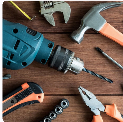
Industrial Tools & Equipment