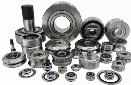
Bearing & Power Transmissions